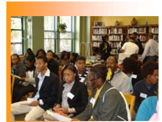
Group 19, Open House